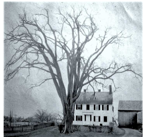
The Pickett Elm

The Pickett Elm on Andover Street, named for the long-time residents who lived in the nearby house, was an enormous and ancient tree, greatly admired by the citizens of Georgetown. With a trunk circumference of 20-25 feet and a height well over 100 feet, it dominated the landscape. In the spring of 1898, a massive limb measuring over three feet in diameter fell from the tree during a severe storm, damaging the house. It was determined that the tree was unsafe and was taken down soon after, much to the sorrow of the community.